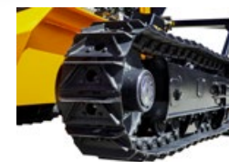
STEEL TRACKS (option)