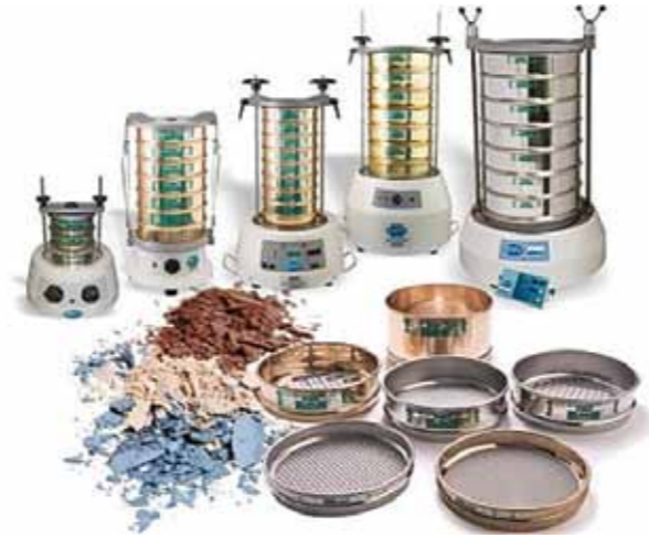
Sieve Sample Analyser