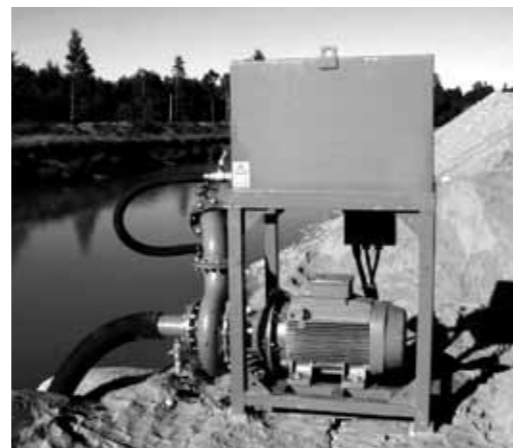
Fresh Water Pump