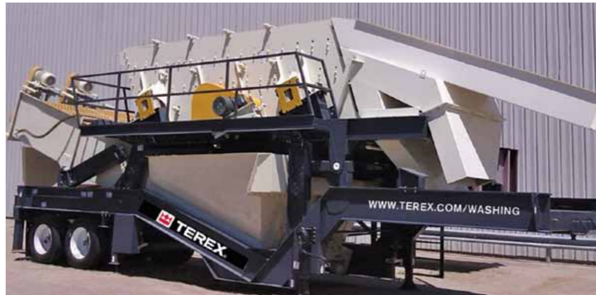
M 166S Sand Screw Plant