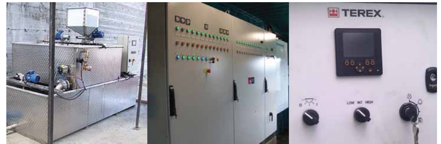
Automated flocculent dosing unit

Fully integrated radio control and remote telemetry systems are also available to further simplify and enhance the operation of the plant and provide the customer with real-time data such as operational status, active alarms and tonnage per hour.