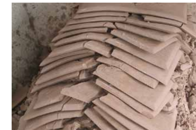
Compressed cakes ready for reuse or disposal