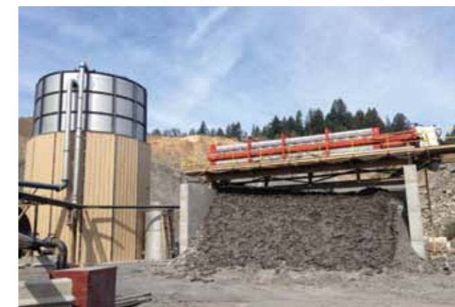
Filterpress with compressed cake