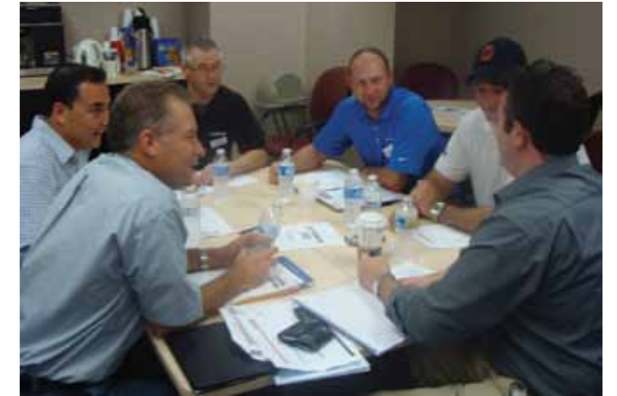
TWS Product Development Forum, Louisville, Kentucky

For more information on training or to book a training session email: TWS.Applications@terex.com