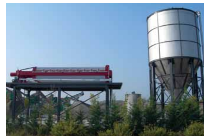
Filterpress and deep cone thickener tank

Matec® is a worldwide leader company in a water treatment and filterpresses and specialises in the design, production and development of waste water purification and filtration plants for many different industries, the most important of which are: aggregates, gravel, sand, stone ceramics, glass. In the last 10 years, Terex Washing Systems and Matec® have successfully installed more than 1000 Washing and Purification plants.